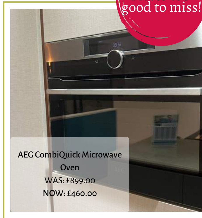
AEG CombiQuick Microwave Oven WAS: £899.00 NOW: £460.00

Due to the ever-evolving market that we operate in, we change our in-store displays regularly so that we can continue to show the most up to date trends and products possible. Therefore, we're able to offer a wide range of ex-display products with huge savings compared to the full retail price.